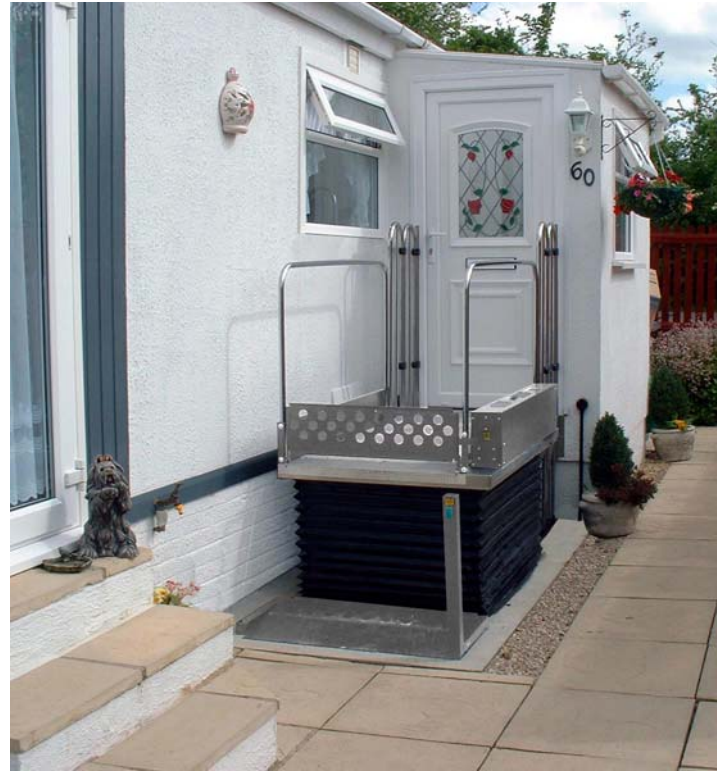
TSL 1000 with double step bridging unit in line with door way