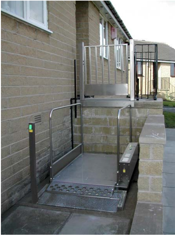
TSL 1000 with upper level gate

The Terry STEPLIFT 1000 is the ideal solution to wheelchair access problems in domestic situations