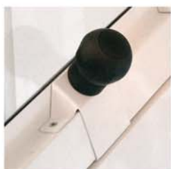
Harmony wheelchair model optional grip handles

A steel liner is fitted into the floor aperture to provide a sealing face for both aperture infill and underpan