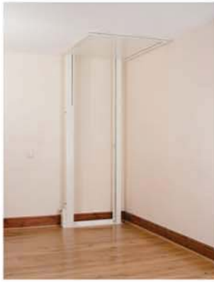
Lower room when lift upstairs