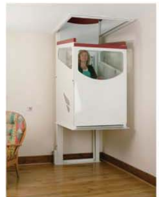
Lift approaching lower floor