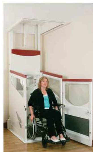
Harmony allows you to move between floors smoothly and safely. Can be used with or without your wheelchair. Fold-up seat available.

Operation is simple. Having called the lift from the easily accessible wall control, sited to suit user, the car door can be opened by the same control. The low integral ramp allows easy wheelchair access and a push button inside the car closes the door. A push of the control button will signal the car to travel to the other floor, automatically lifting or replacing the aperture ceiling panel en route, where the reverse procedure is followed to exit the car.