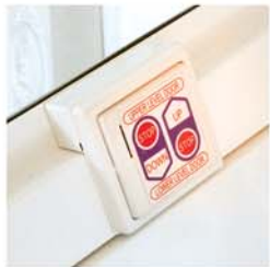
Harmony carriage controls

Toughened safety glass windows which do not scratch like plastic