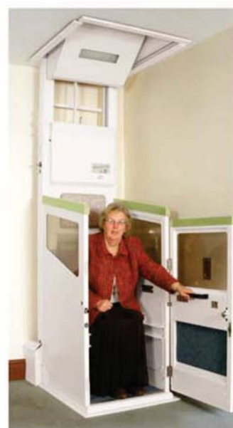
Harmony Compact at lower level with fixed seat.