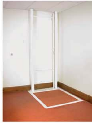
Upper room when lift downstairs