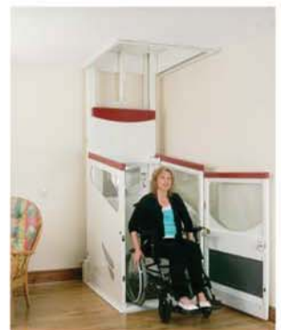
Exiting the lift downstairs