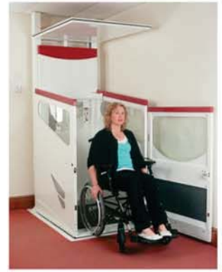
Entering the lift upstairs

Both lift-up aperture infill and carriage underpan are designed to provide a minimum half hour fire protection and both are fitted with smoke and intumescent fire seals. Pressure sensitive safety surfaces are incorporated in both which stop the lift if the lift is obstructed.